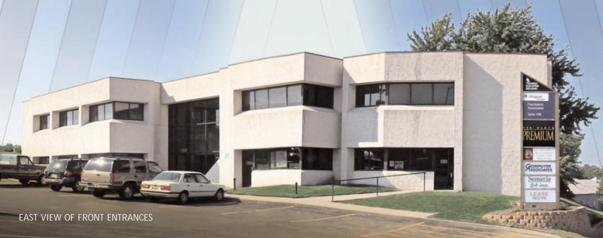
EAST VIEW OF FRONT ENTRANCES